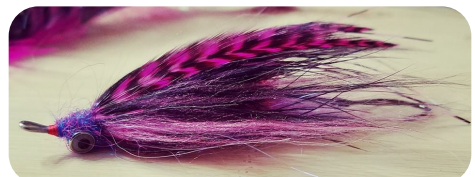
Polar Fibre Intruder

Polar Fibre is a marabou replacement. It is close to craft fur but softer and finer than select craft fur and averages 3 inches in length. Its applications are relatively simple in tails and wings like marabou, yet due to its make-up and ability to hold shape with its movement, you have a larger selection of patterns were you can use it. Marabou is a great natural material for bulk, color, and movement. You can also get slim patterns by using small amounts as well, making it a very versatile natural feathers. That's why there are so many synthetics trying to replace it, and that's why Polar Fibre is one of the top go-to replacements with craft fur.