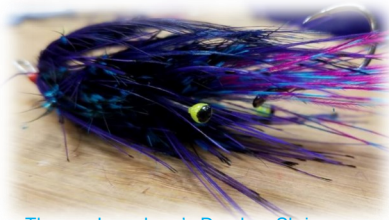
Thomas Lamphere's Drunken Shrimp Purple/blue w/ Chartreuse Shrimp eyes

The color selection, although small compared to most materials, is rather impressive when you compare them to other shrimp and crab eyes. These are not painted but dyed in a way that adds translucency to the eye. They have a black pupil and added glitter to give some flash. What