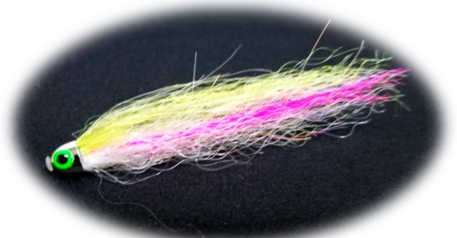
Anil's Shock & Awe with SF Blend and Pink Fluoro Fibre

To go with the statement "less is more" - having less material for a bulky fly adds a transparent look to it. Add in the fact that a large portion of the colors have a natural translucent appearance to them, and you get something a natural bucktail can't offer. Another advantage is the ability to shed water. Shedding water for a large fly is important when you're casting it all day long. Water-logged flies are a pain to cast and become tiresome after a period of time. This is the benefit of having a material that creates bulk with little material needed.