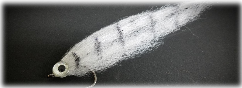
Ghostfish with White Mirror image and Steelhead Grey Deadly Dazzle

Mirror image is a denser material that has more uses than just a classic baitfish pattern. This product has a cotton candy texture, and is also a translucent material coming only in pale colors. This is where it differs from other material, it can be used for a thicker and denser baitfish while staying light in color—much like a fish that is using light as its own camouflage. But one advantage to Mirror Image that other products don't have is the shrimp and crab patterns that can be tied with it. This material stacks and trims with ease for simple crab patterns. With its thin-but-dense properties, it flairs out when stacked together for a body. To go even further with this product, H2O came out with Deadly Dazzle which is Mirror Image mixed with Super UV Flash. This gives you another option to the fly you're tying. Have a few without flash, and have a few with a UV enhancer for a bright scale affect, or mix them together in the same pattern.