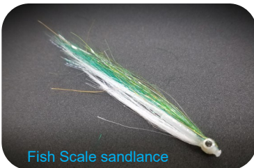
Fish Scale sandlance

Fish Scale is a crimped nylon with krystal flash mixed into it, providing a scale look in the midst of the tying material. This is perfect for baitfish patterns both big and small. Not meant to be as bulky as SF Blend, this material makes more streamline baitfish patterns with ease. You can Spread out the material for a flat and deep baitfish, or keep it slim for a sandlance or candle fish imitation. Fish scale also works well in tandem with SF blend, using it as a color base to go over top of the fly, or give your fly a lateral line by using it in the middle of the pattern. For example: Take Anil Srivastava's Shock & Awe made from White and Chartreuse SF blend and you get a great coho fly. Adding a little bit of pink or blue fish scale in the middle of the fly creates a trigger point for when base color combinations may not be working.