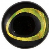
Black & Gold

If you want to be realistic with your bug, you need to take a look at the Ultra 3D Eye's . The Ultra 3D Eye's are about as real as you can get for a fish eye. They are very detailed with the D/Oval shaped pupil, and come with a minimum of three layers on each eye. The other amazing part is the selection—10 different models to pick from. This is like having your cake and eating it too—your favorite cake, and 10 of them. These eyes truly make any streamer or baitfish pop. Here we are showing you a couple of these eyes so you can get the idea. Every single model glares at you in need of being put on your streamer.