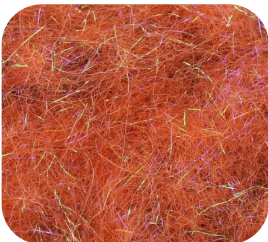
Alpaca Blend Dubbing

The one product that fly tying is not in short supply of is a dubbing. There are a hundred if not a few thousand different kinds of dubbing out there, each with its own unique features. Even Sybai has several different kinds from all natural to pure synthetic, and everything in between. We have chosen our top two to spot light here. These are the two dubbings that we used in our first Live On The Fly tying session last Thursday— Flash Nymph Dubbing and Alpaca Blend Dubbing.